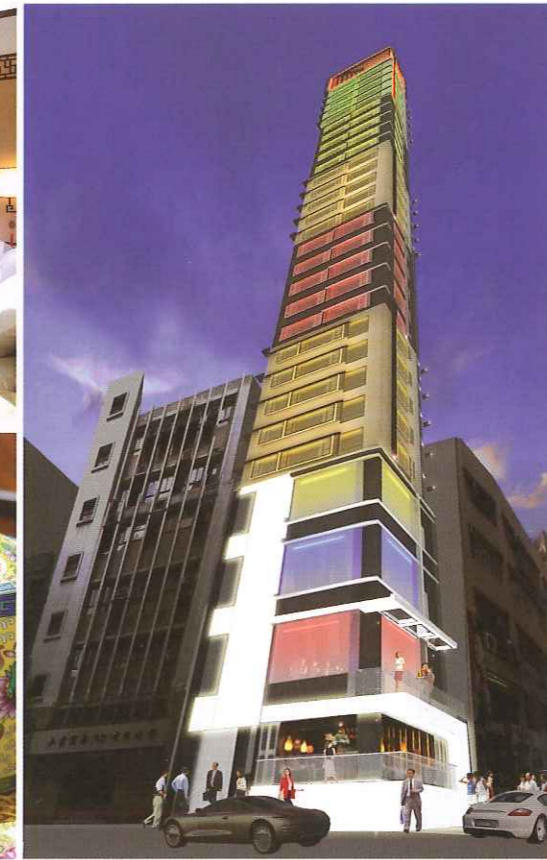
This page clock-wise: Deluxe Harbour View Room, "The Mercer" opening in Yr. 2011, Chinese mugs in guest rooms, Oriental décor in Breeze Lounge